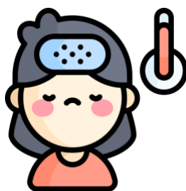
發燒 faat3 siu1