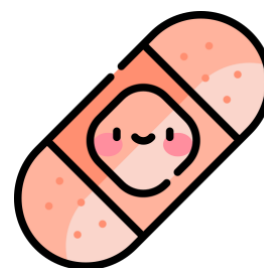
醫治 ji1 zi6