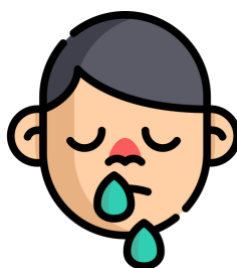
流鼻水 lau4 bei6 sei2