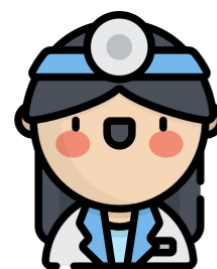
醫生 ji1 sang1