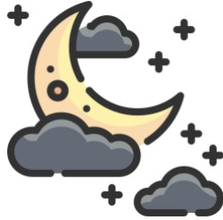
天空 tin1 hung1