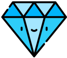
鑽石 zyun3 sek6